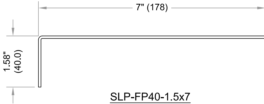
SLP-FP40-1.5x7 PERIMETER FILLER PLATE 40 mm FFH X 7" Wide 14 Ga. (.08") HDG Steel